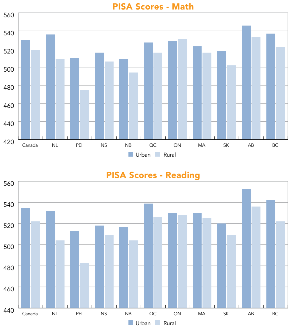
Figure 1: PISA 2003 Math, Reading & Science Scores by Province

Achievement is also lower in rural areas: in the 2003 Programme for International Student Assessment (PISA) urban students outperformed rural students in math, reading and science. These rural-urban differences in achievement persist across all the provinces (see Figure 1).